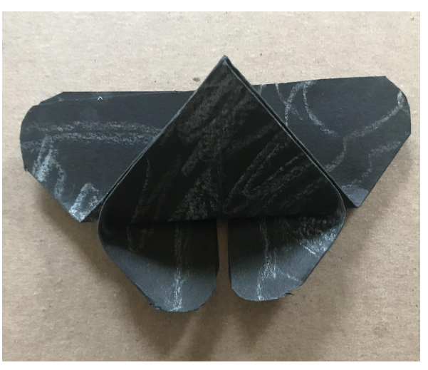
8) Turn over and fold the bottom corner up.