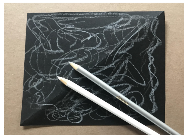
1) On a square piece of paper, use colored pencils or crayons to make a design.

square black paper white/silver colored pencils, crayons, or chalk scissors