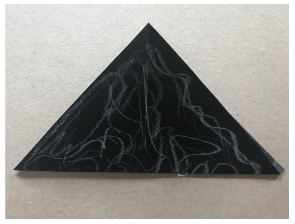
2) Fold the paper diagonally in both directions.