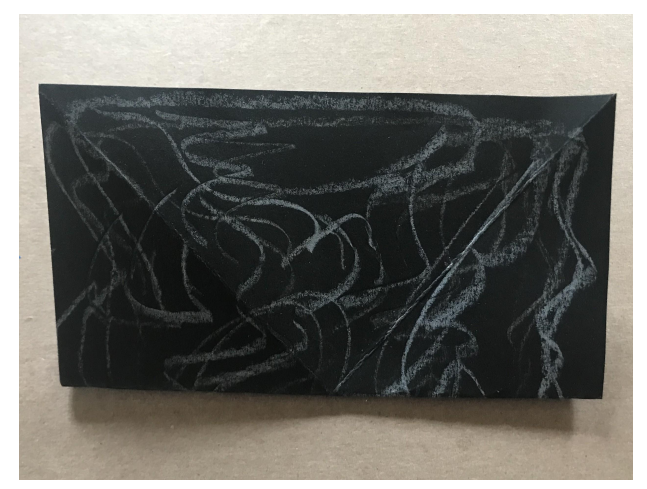
3) Fold the paper in half in both directions.