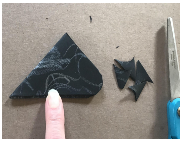
6) Use scissors to trim one corner.

5) Tuck in the triangle at the other end.